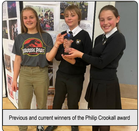
Previous and current winners of the Philip Crookall award